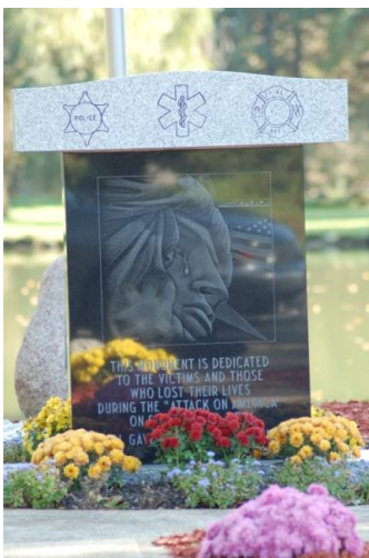
Original Ridgewood 9/11 Memorial Monument