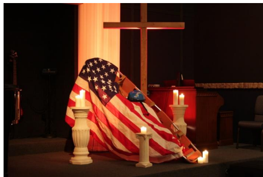
9/11 Memorial Cross Pointe Trinity Church in Evansville, Indiana

He also attended a parade in Fort Branch, Indiana on September 11, 2011. The flag in the parade was the one from Ground Zero. The parade organizer told the Boy Scouts this flag was the most important piece in the parade. The parade watchers all stood as the flag passed.