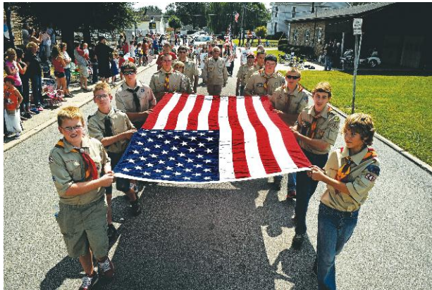
Parade in Fort Branch, Indiana